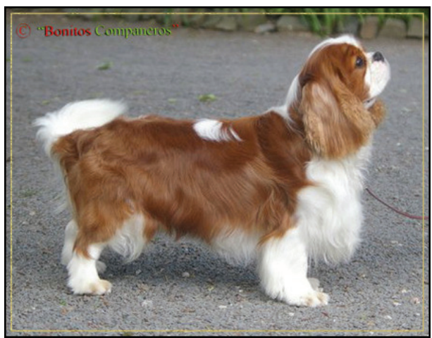
Bonitos Companeros Unbelievable (Blake) at 4 mos. & 17 mos. (UK Ch. Maibee Make Believe x Int'l, Ger. & Austrian Ch. Aranel Energie)